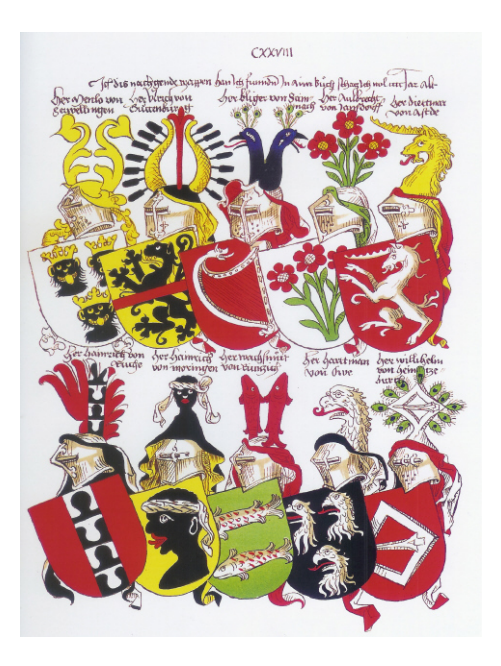
■ GRU:128r has items from WLH nos. 5, 15, 6, 10, 8; 11, 16, 20, 9 and 23.

The human figure, in various positions and blazoned as monk, morian or man, for Tyro king of Scotland [3], or possibly Hibernia, is also found in ZUR:4 and reappear ind later armorials, e.g. Richental's chronicle of the Church council in Konstanz in 1414 (KCR:185), in Grünenberg (GRU:215), and finally qtg the actual arms of Scotland in RUG:31 and DWF:90 – all armorials from the swabian region. Some of the responsible artisan-armorists might not have used the Manesse, but rather the Weingartner manuscript in Konstanz as their source, which was more convieniently placed.